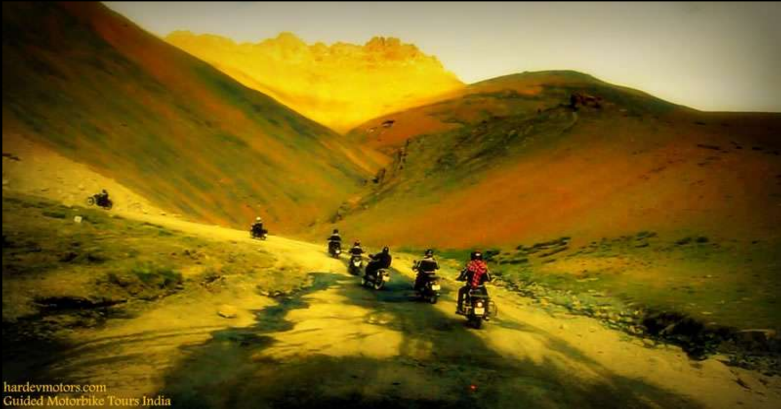
hardevmotors.com Guided Motorbike Tours India

Get ready to enter in the pure Himalayan wilderness! We will cross Patseo, which was until the 1950's a trade point for Changspa nomads and traders from Lahaul, Zaskar and Kullu. We'll ride on a torturous zigzag shaped uphill road that lies in the shadow of the hanging glacier to Baralach La (4900m). Further, at Lachulung La, you can see incredible natural sculpture built by the wind blowing through the rocks of a canyon that reminds one of a scenery in Arizona. We start our descent to the green fields of Sarchu plateau and finally reach Pang, an useful halt on Manali Leh highway. There we'll camp and spend a fun and convivial time together before sleeping among the clouds as this place reaches an altitude of 4500m!